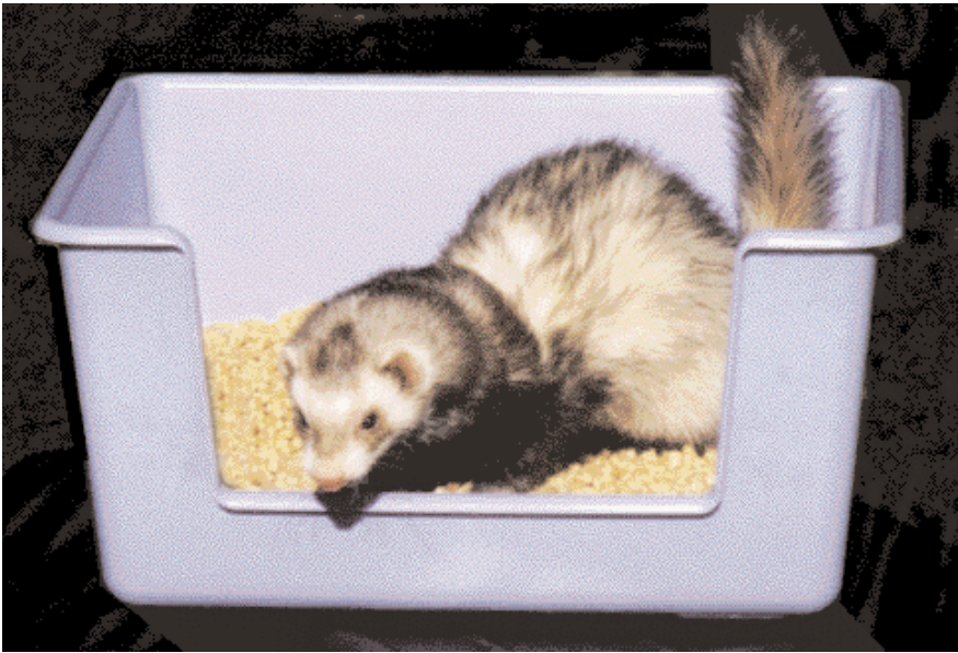
A ferret's litter box must be big enough to hold the ferret and have high sides and a low entry.

Another way for your ferret to get the hint about the proper use for a litter box (other than digging or as a bed) is to leave a "starter" poop in the box. Do this by placing your ferret's previous poop into the box. Your ferret will hesitate to play in a dirty box, and the smell will remind it of what belongs in a litter box. You can clean the box completely once your ferret is conditioned to use it.